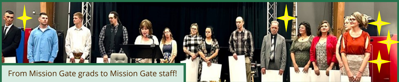
From Mission Gate grads to Mission Gate staff!

The staff members gave their testimonies and held up enlarged photos from their lives before Christ.