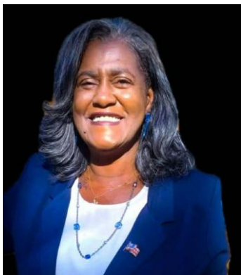
Incumbent Mayor Patsy Johnson Ward Hoover

•(Seeking re-election – in office since July 1, 2022)