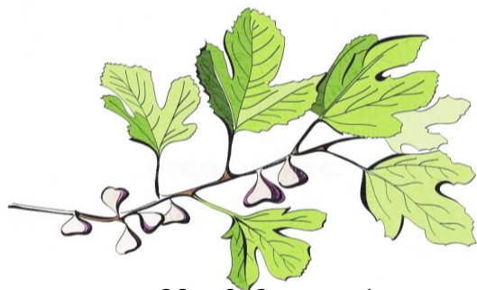
Parable of the Fig Tree