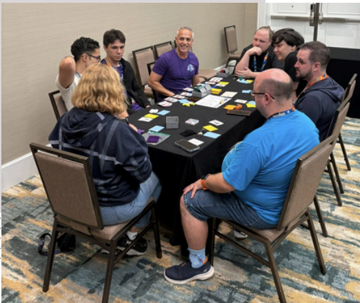
PLAYTESTING AT DICE-TOWER EAST