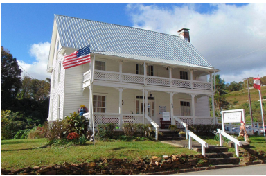
Tabor House History Museum