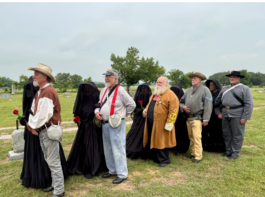
Black Roses and Gentlemen Greys