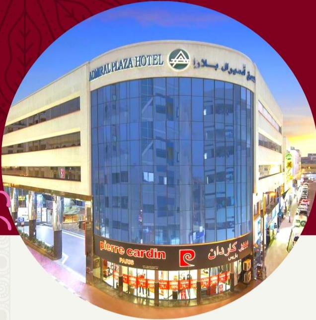
ADMIRAL PLAZA BUR