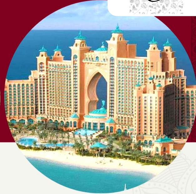
ATLANTIS THE PALM