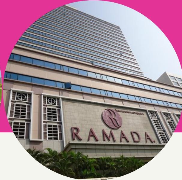
RAMADA DMA BANGKOK