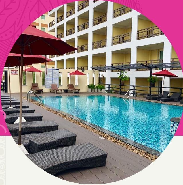
GOLDEN SEA RESORT 3 Star