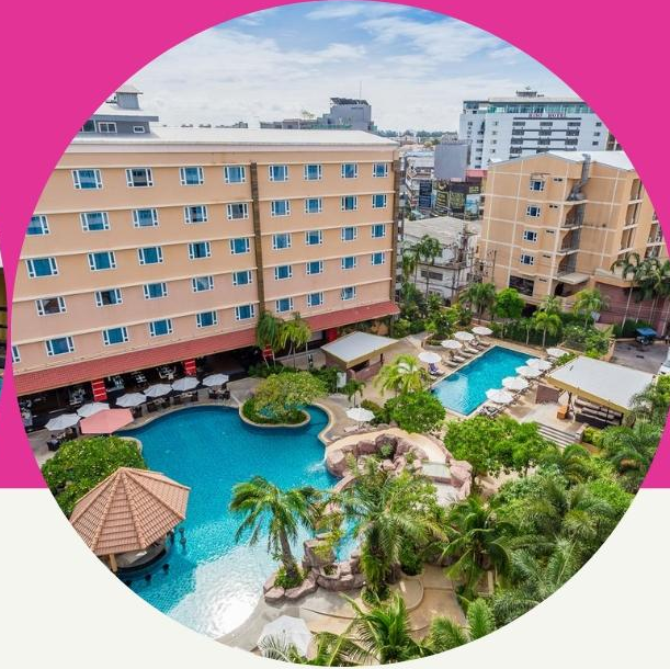
NOVA PLATINUM HOTEL 4 Star