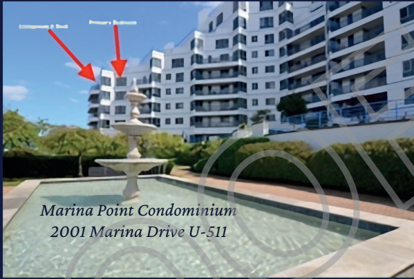
Marina Point Condominium 2001 Marina Drive U-511

Attention: This floor plan is provided as a courtesy, and was gathered from third party sources including the developer and public records. Marina Bay Properties, LLC and its associated division are not an agent or representative in measurements of this floor plan or warranties as to the accuracy of this information. Measurements are approximate and should be verified.