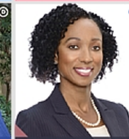
TAMEIKA CARTER FOR FORT BEND COUNTY JUDGE DISTRICT COURT 400TH TAMEIKACARTER4JUDGE.COM