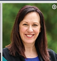
MARY "MJ" HEGAR FOR TEXAS U.S. SENATOR OF THE UNITED STATES OF AMERICA MJFORTHTEXAS.COM