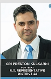
SRI PRESTON KULKARNI FOR TEXAS U.S. REPRESENTATIVE DISTRICT 22 SRIPRESTON.COM