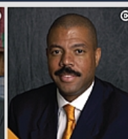
SENATOR BORRIS MILES FOR TEXAS STATE SENATOR DISTRICT 13 BORRISMILES.COM