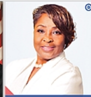
CARMEN TURNER FOR FORT BEND COUNTY TAX ASSESSOR-COLLECTOR VOTECARMENTURNER.COM