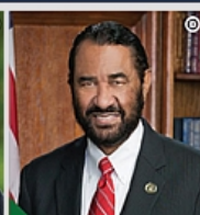
CONGRESSMAN AL GREEN FOR TEXAS U.S. REPRESENTATIVE DISTRICT 9 ALGREEN.ORG