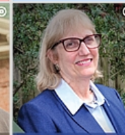
JANET BUENING HEPPARD FOR TEXAS JUDGE DISTRICT COURT 387TH TINYURL.COM/YXPSN480