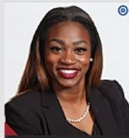
BRIDGETTE SMITH-LAWSON FOR FORT BEND COUNTY COUNTY ATTORNEY VOTEFORLAWSON.COM