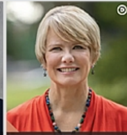
CHRYSTA CASTAÑEDA FOR TEXAS RAILROAD COMMISSIONER CHRYSTAFORTXAS.COM