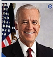
JOSEPH R. BIDEN FOR PRESIDENT OF THE UNITED STATES OF AMERICA JOEBIDEN.COM