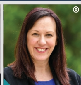
MARY "MJ" HEGAR FOR TEXAS U.S. SENATOR OF THE UNITED STATES OF AMERICA MJFORTHETEXAS.COM