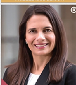
JUDGE AMPARO MONIQUE GUERRA FOR JUSTICE, 1ST COURT OF APPEALS, PLACE 5 AMPAROFORJUSTICE.COM