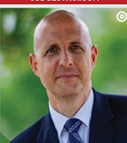
JUDGE BRANDON BIRMINGHAM FOR TEXAS JUDGE, COURT OF CRIMINAL APPEALS, PLACE 9 JUDGEFORBIRMINGHAM.COM