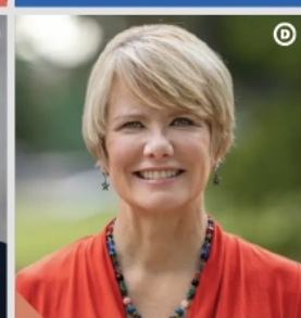
CHRYSTA CASTAÑEDA FOR TEXAS RAILROAD COMMISSIONER CHRYSTAFORTHETEXAS.COM