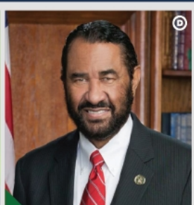
CONGRESSMAN AL GREEN FOR TEXAS U.S. REPRESENTATIVE DISTRICT 9 ALGREEN.ORG