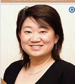
JUDGE TINA CLINTON FOR TEXAS JUDGE, COURT OF CRIMINAL APPEALS, PLACE 4 TINYURL.COM/YXOFHD29