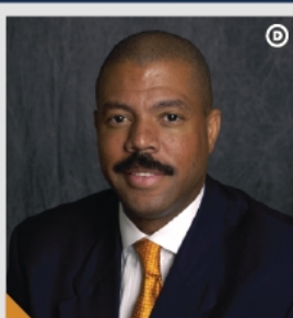
SENATOR BORIS MILES FOR TEXAS STATE SENATOR DISTRICT 13 BORRISMILES.COM