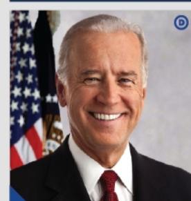
JOSEPH R. BIDEN FOR PRESIDENT OF THE UNITED STATES OF AMERICA JOEBIDEN.COM