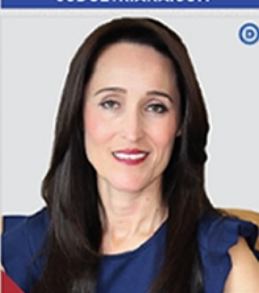
VERONICA RIVAS-MOLLOY FOR JUSTICE, 1ST COURT OF APPEALS, PLACE 3 VERONICAFORJUSTICE.COM