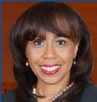
JUDGE STACI WILLIAMS FOR TEXAS JUSTICE SUPREME COURT, PLACE 7