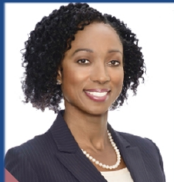
TAMEIKA CARTER FOR FORT BEND COUNTY JUDGE DISTRICT COURT 400TH