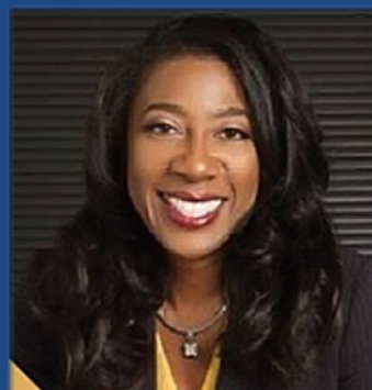
JUDGE ELIZABETH DAVIS FRIZELL FOR JUDGE, COURT OF CRIMINAL APPEALS, PLACE 3