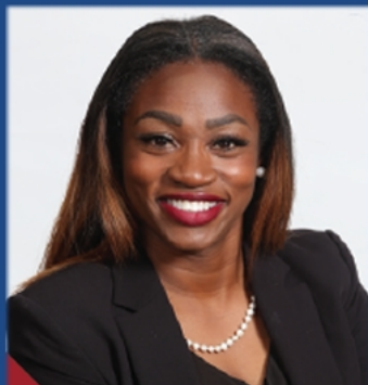
BRIDGETTE SMITH-LAWSON FOR FORT BEND COUNTY COUNTY ATTORNEY