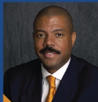
SENATOR BORRIS MILES FOR TEXAS STATE SENATOR DISTRICT 13