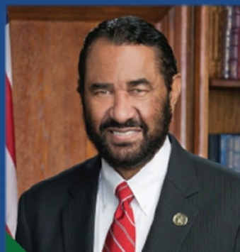
CONGRESSMAN AL GREEN FOR TEXAS U.S. REPRESENTATIVE DISTRICT 9