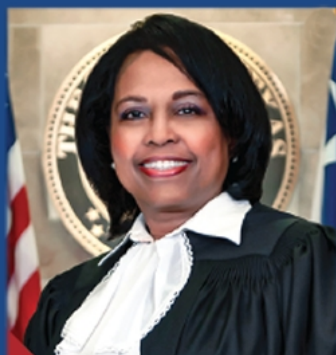
JUDGE TEANA WATSON FOR FORT BEND COUNTY JUDGE COUNTY COURT AT LAW #5