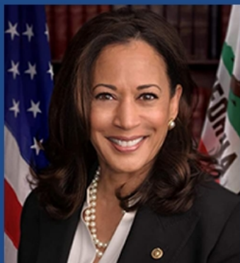
KAMALA HARRIS United States Vice President

Please VOTE DEMOCRATIC From Start to Finish November 3, 2020