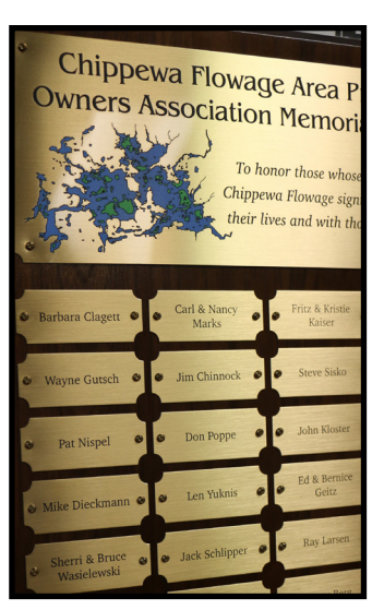
Visit <u>WWW.CFAPOA.ORG</u> for more information.