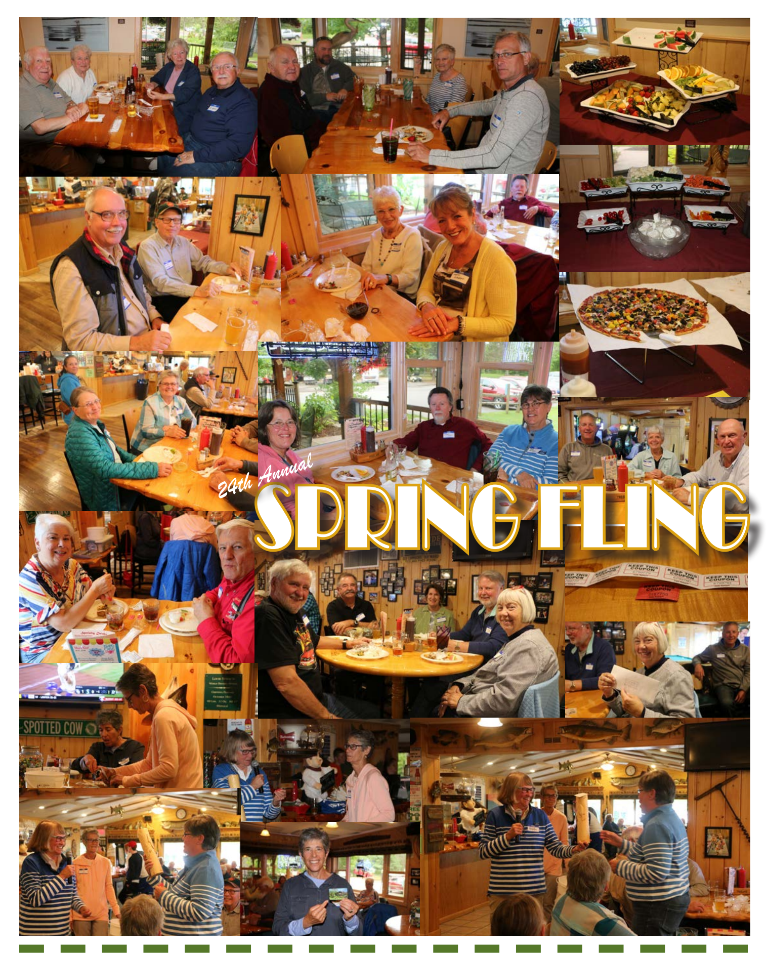
Visit our Web Site: http://www.cfapoa.org/