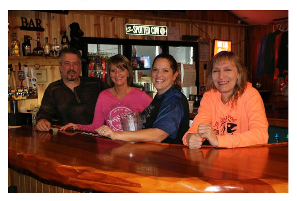
Special Thanks to the staff at The Rusty Hook for aesome food, beverages and service at the annual Holiday Party.