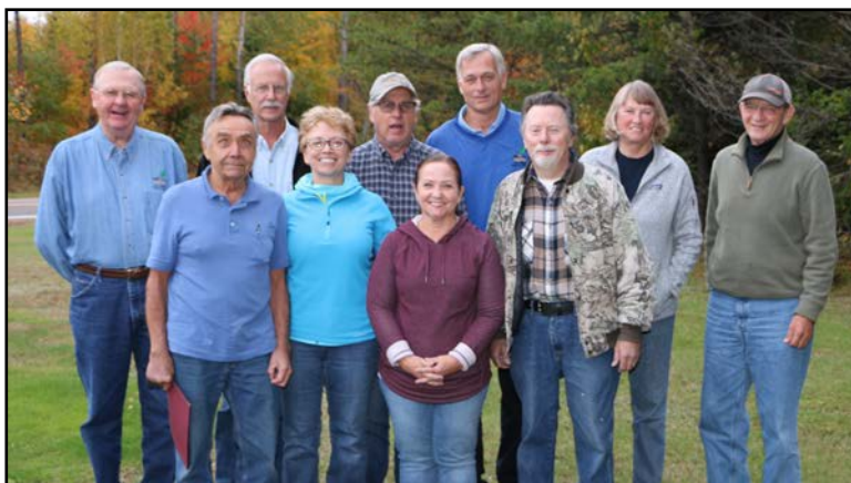
CFAPOA Board Members.

Board meetings are held at 6:00 p.m. CT at Town of Hunter Hall.