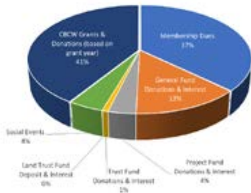
2023 CFAPOA Receipts