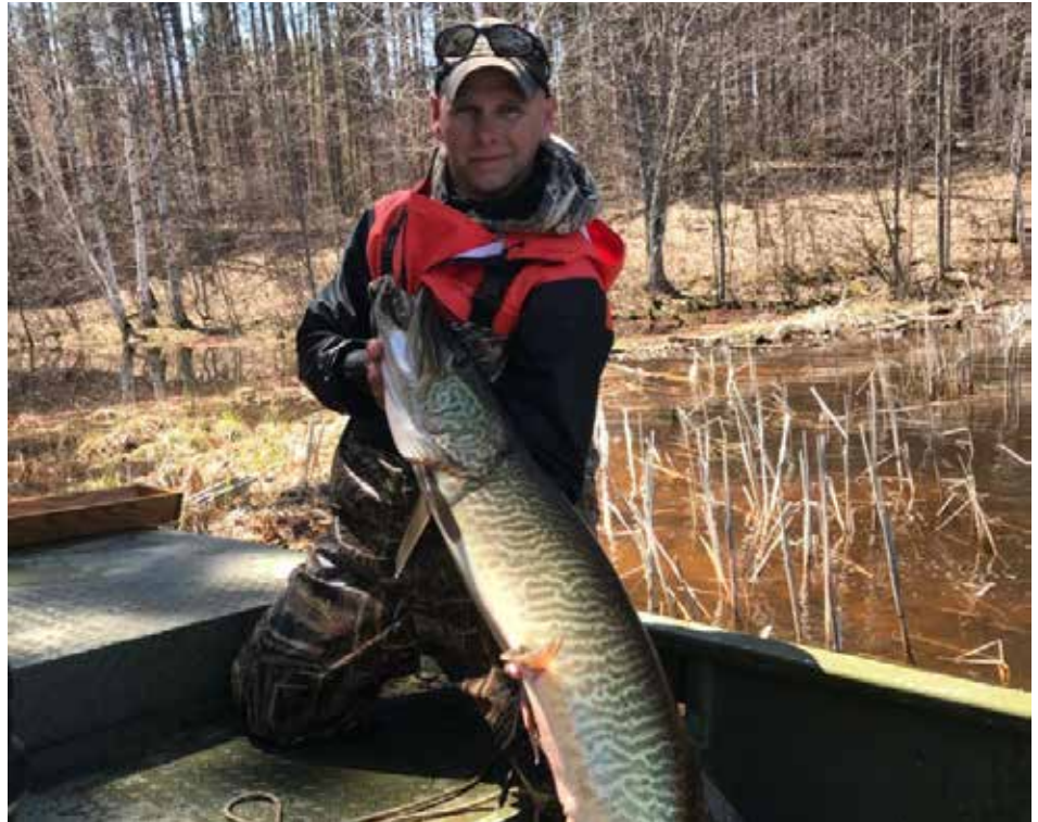
Spring 2019. A hatchery technician from Spooner with a nice tiger musky caught in the Chippewa Flowage.

There may well be a few other projects that come together for 2021. I'm hoping it will be a year of restoration, in many ways. As always, please feel free to drop me a line if you have any fisheries-related questions. We also plan to host an information meeting (virtual) for Sawyer County fisheries issues sometime later this winter. I will send out information on that, via email, to CFAPOA leadership.