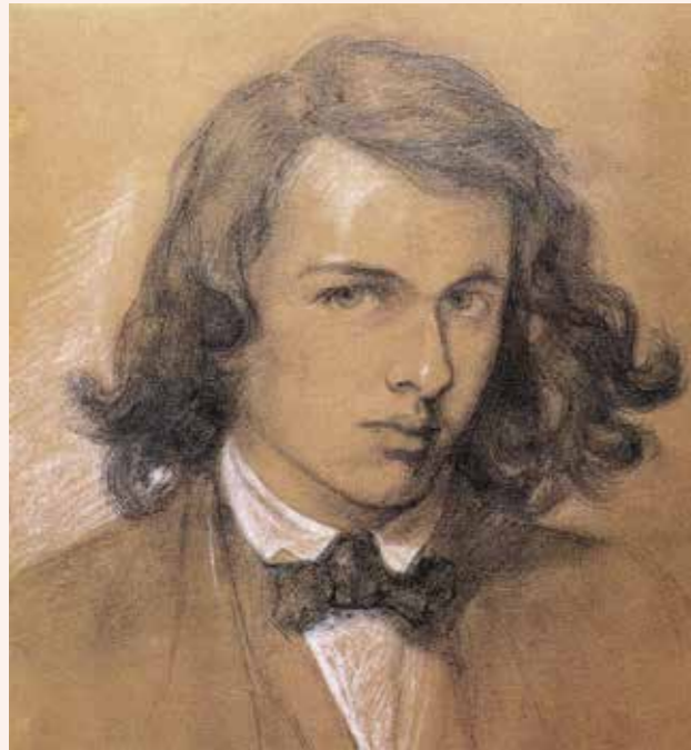
DANTE GABRIEL ROSSETTI PAINTER AND POET Painter, poet, illustrator, translator and founding member of the Pre-Raphaelite Brotherhood, Rossetti was a man of many talents. He was born at 38 Charlotte Street (now 110 Hallam Street) along with his notable siblings.