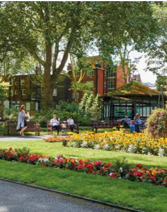
GREEN STREETS The vibrant pockets of Fitzroy Square and Paddington Street Gardens provide some leafy relief.