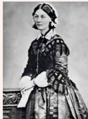
FLORENCE NIGHTINGALE NURSE In 1854, Florence Nightingale left London for the Crimea and changed medical history. Today, Harley Street continues in this medical tradition with world-renowned clinics and specialists lining the street from top to bottom.

The blue plaques dotted around the area will tell you that over the years, both Marylebone and Fitzrovia have had their fair share of talented and celebrated individuals walk the streets. Maybe it's the village feel of Marylebone, or the charm of Fitzrovia – writers and musicians alike have turned to the area for inspiration.