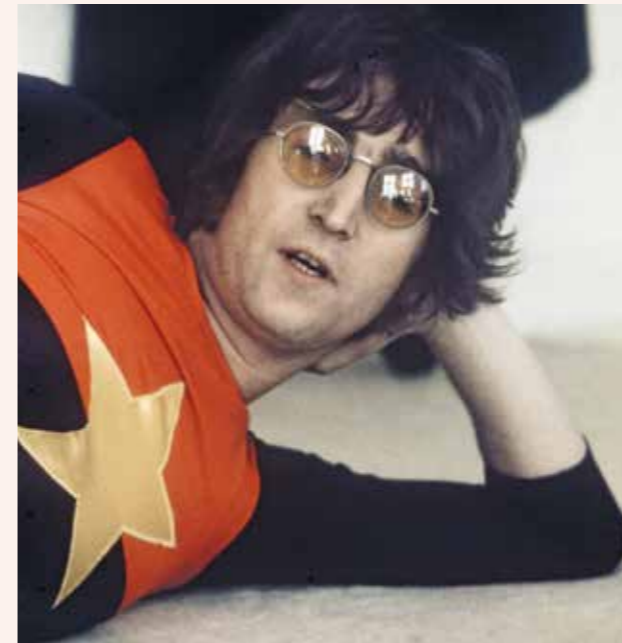
JOHN LENNON MUSICIAN AND ACTIVIST It's 1968, the Summer of Love has passed, and John Lennon moves into 34 Montagu Square with Yoko Ono – it marks both a personal and artistic shift in his life.