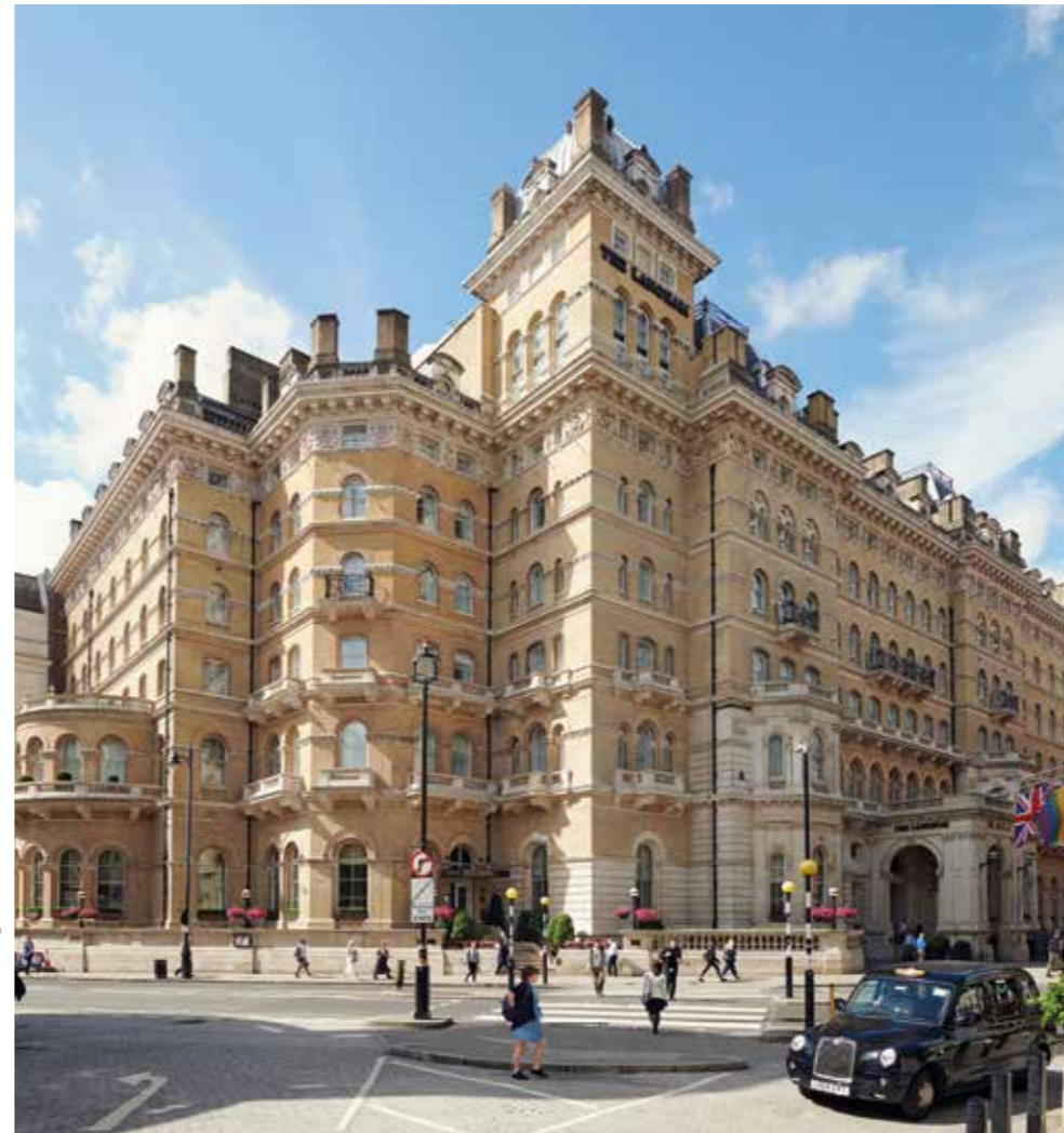
The Langham Hotel