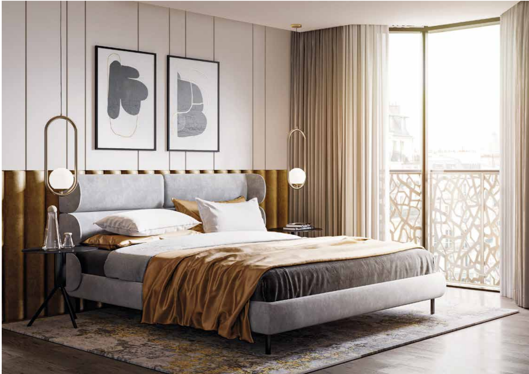
A DELIGHTFUL SANCTUARY The generous lantern bay windows ensure you start and end your day in a serene setting.