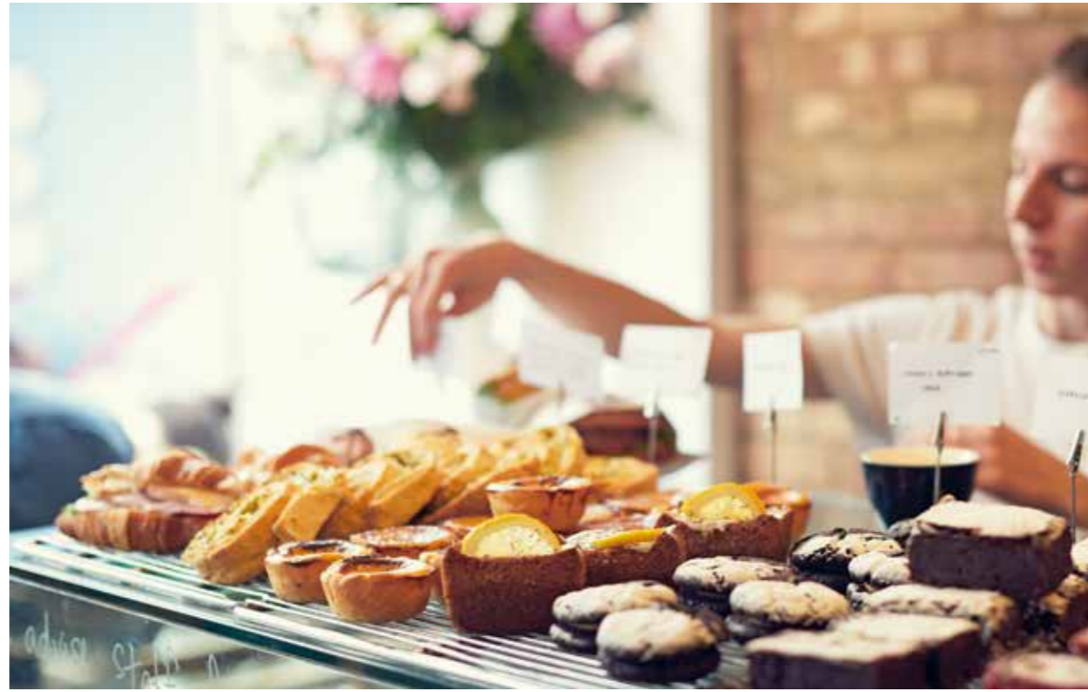
CAFÉ SOCIETY There is plenty of choice, whether you're looking for a bespoke blend or sumptuous cake.