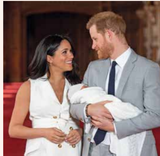
ARCHIE MOUNTBATTEN-WINDSOR BRITISH ROYAL FAMILY The seventh in line to the British throne was born at the Portland Hospital on Great Portland Street, adding to the list of notable births, both Royal and celebrity, that the hospital is famous for.