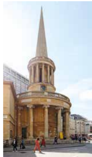
All Souls Church