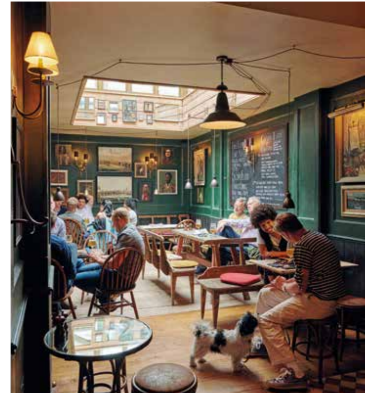
Lore of the Land