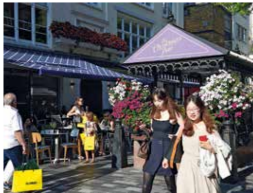
St Christopher's Place

RETAIL THERAPY Shop global brands, designer labels or independent retailers, all just a stroll away.