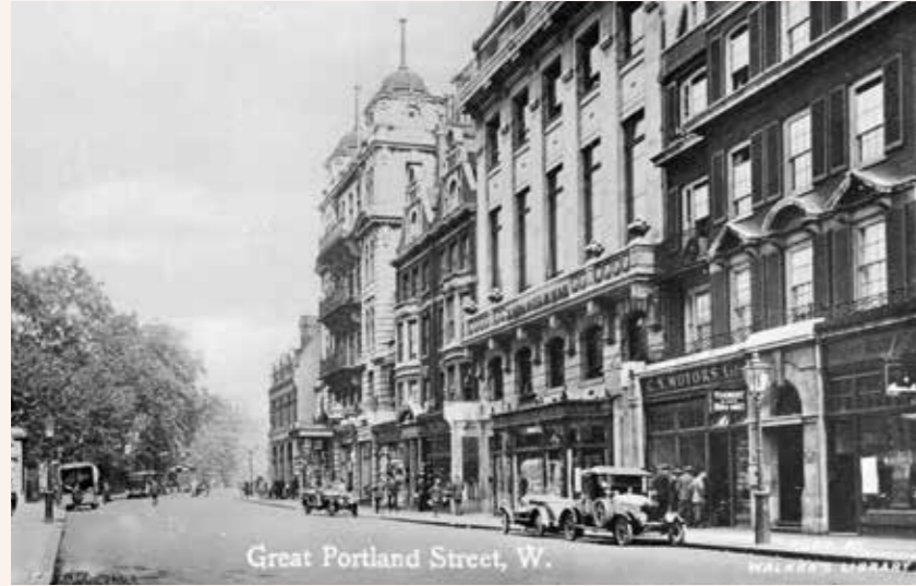
WHEEL OF TIME From 'Motor Row' to textile hub, Great Portland Street has an exciting and storied past.