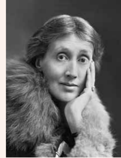
VIRGINIA WOOLF WRITER Literary icon and early feminist Virginia Woolf moved into 29 Fitzroy Square in 1907. It was within these walls that The Bloomsbury Group would convene, and where Woolf would compose her first novel.

The blue plaques dotted around the area will tell you that over the years, both Marylebone and Fitzrovia have had their fair share of talented and celebrated individuals walk the streets. Maybe it's the village feel of Marylebone, or the charm of Fitzrovia – writers and musicians alike have turned to the area for inspiration.