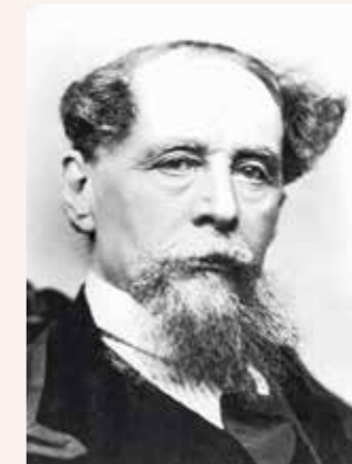
CHARLES DICKENS WRITER While living at 1 Devonshire Terrace (now 15-17 Marylebone Road), Dickens wrote a number of his principal works – a cultural frieze marks where the house once stood.