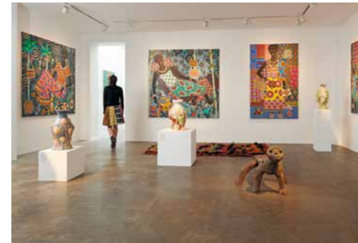
Rebecca Hossack Art Gallery