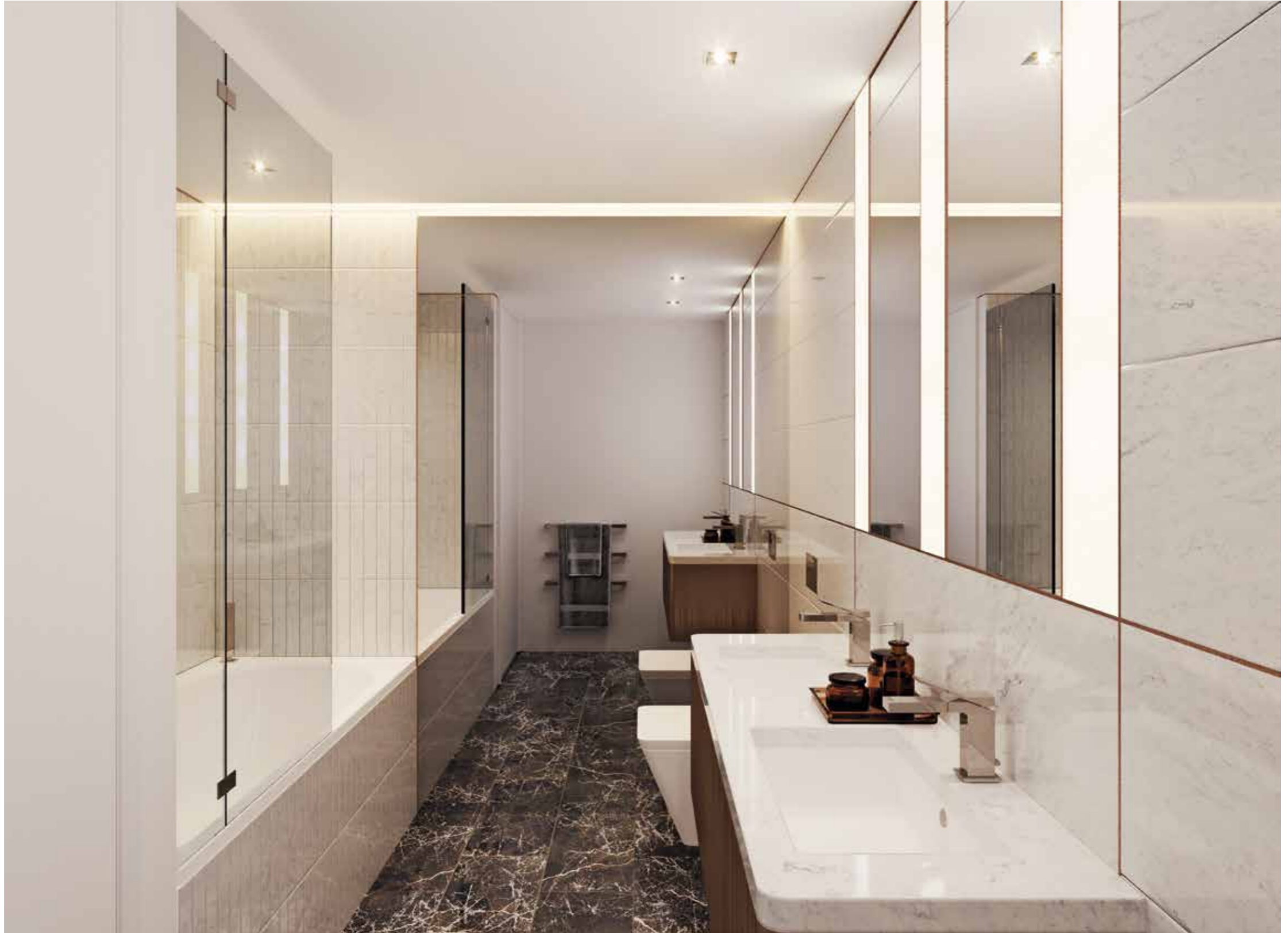
DOWN TO THE DETAILS With clean lines and quality finishes, the bathroom combines modern design with a classic touch.