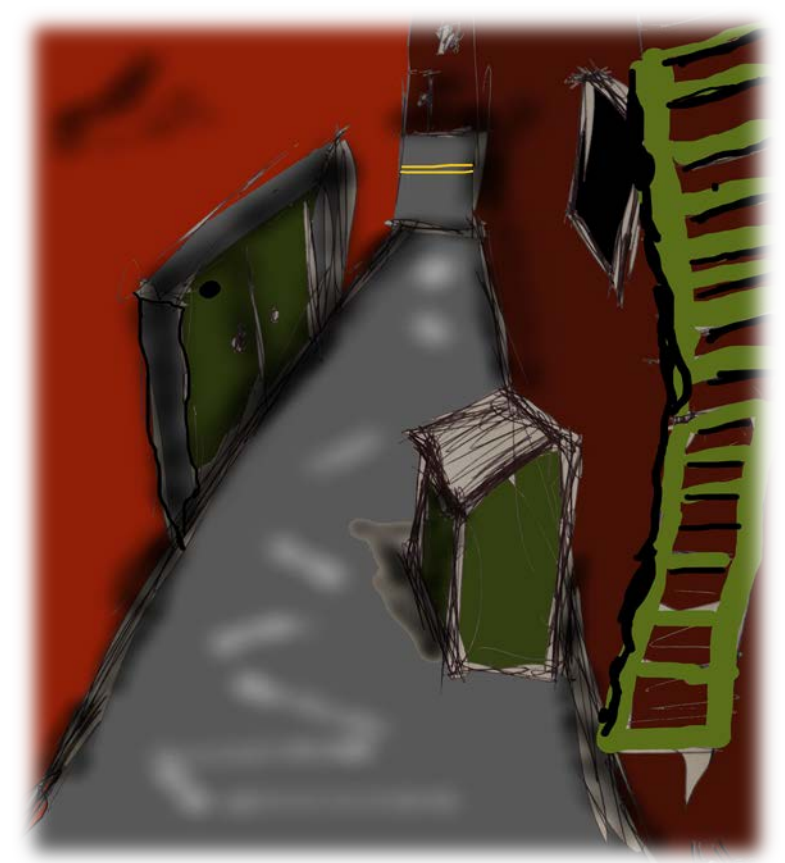
"Oh, you lead the way," I said.

We find the hole in the fence and find ourselves in an old abandoned subway. People appeared to have been sleeping down there at some point, we got scared, so we went back to the park, to our sleeping spot. Night quickly approached and we began to get sleepy and we fell asleep. Late in the night we were awoke, by a sound, by the sound of a man's voice, "What are you doing here" A man barks, his flashlight was blinding our eyes...so much so, we could not see who had asked.