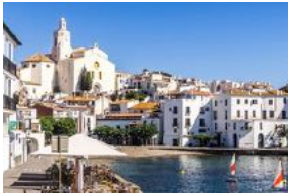
Salvador Dali's Cadaqués