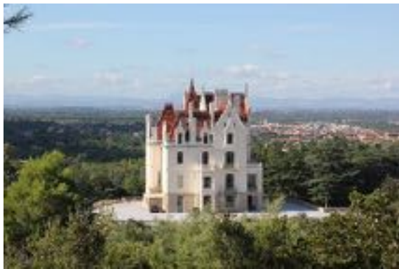
Down the road from the farmhouse are the vineyards and fine dining of Château Valmy