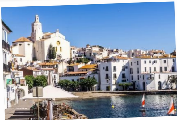
Salvador Dali's Cadaqués