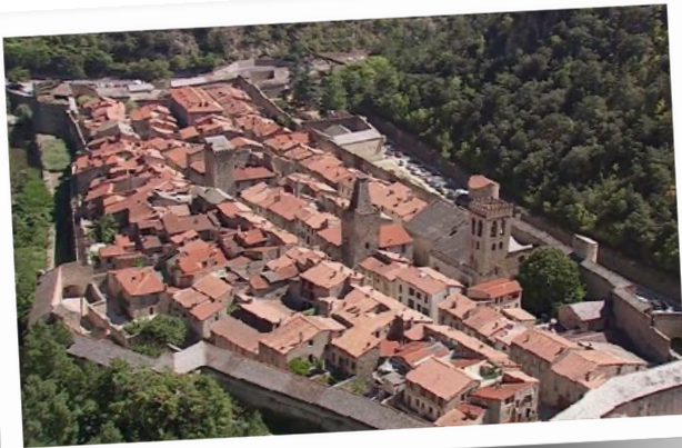
The nearby walled town of Villefranche-de-Conflent is a UNESCO World Heritage site.

Come with me to my little corner of France for a wonderful experience of everything French! Allons-y! Let's go!