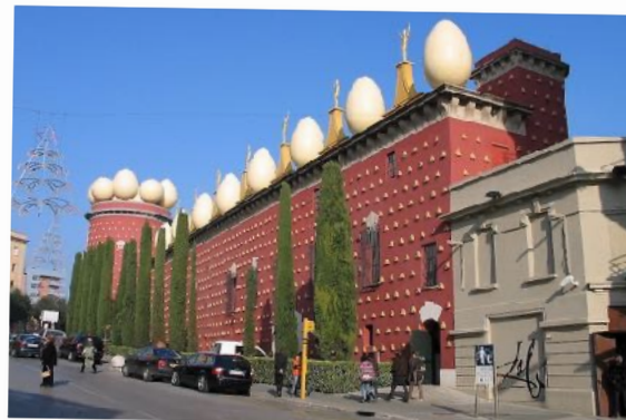
Just over the border is the Salvador Dali Museum in Figueres, Dali's hometown.