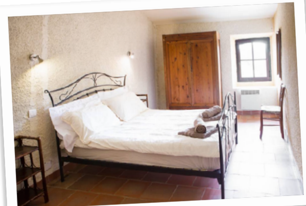
Roussillon Farmhouse bedroom