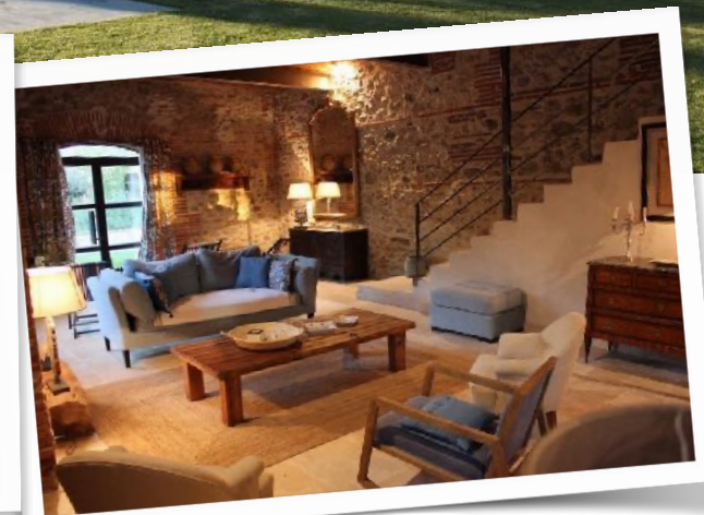
Top: the newly-renovated Mas de Villeclaire. Above: the living room at the Mas.

Forget the trains buses and planes, this is a real holiday. The 'Roussillon Farmhouse' and the 'Mas de Villeclaire' are perfectly located for the Mediterranean, the Côte Vermeille, the Pyrenees, and the regional capital Perpignan. And Spain and the Costa Brava are a stone's throw away.