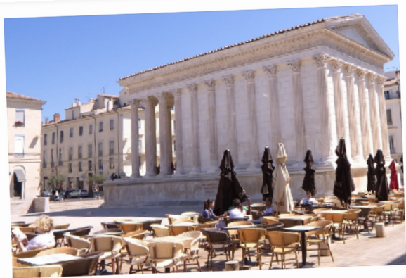
Maison Carrée, Nîmes