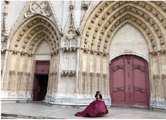
Cathédrale Saint-Jean-Baptiste in Lyon.