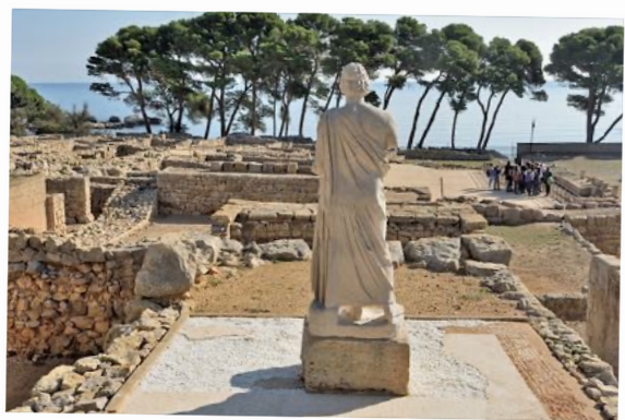
Have lunch just over the border beside the ancient ruins of Empúries