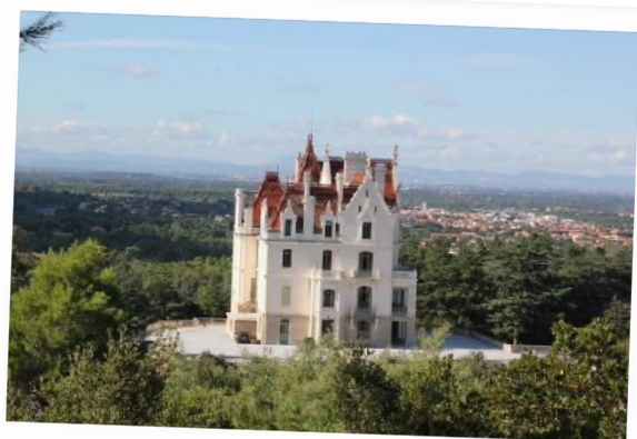
Down the road from the farmhouse are the vineyards and fine dining of Château Valmy