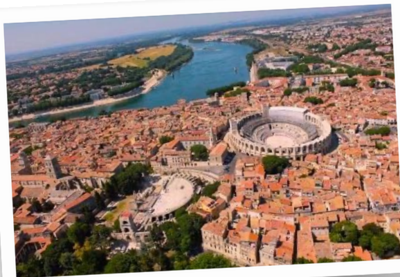
Roman theatre and Amphitheatre, Arles