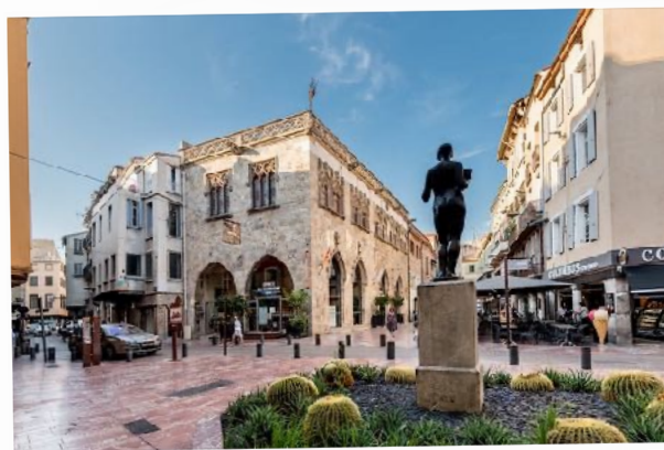
The regional capital, Perpignan