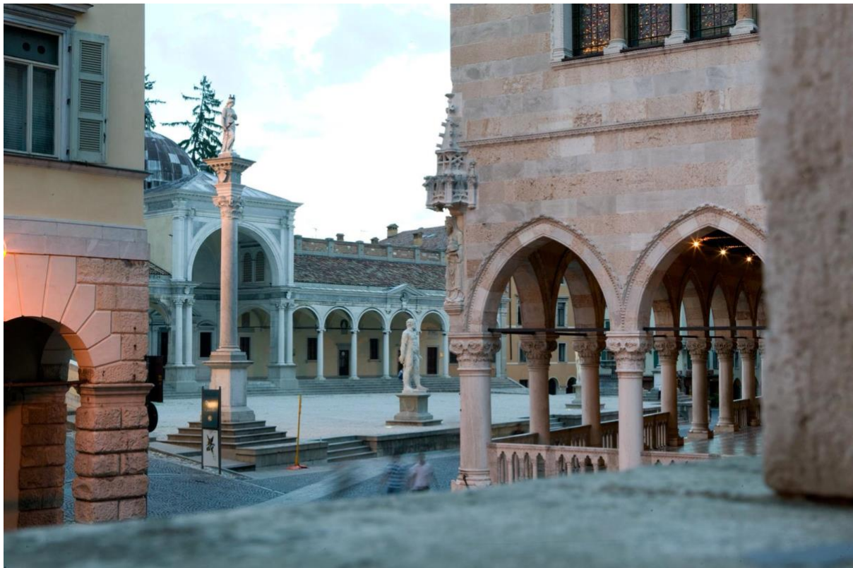
Udine – Piazza della Libertà

In the morning we will take a short tour on foot of Udine a university town shaped by the Venetian style of architecture. Elegant and refined Udine has everything you picture in an Italian town – art, architecture, great food and amazing stories.