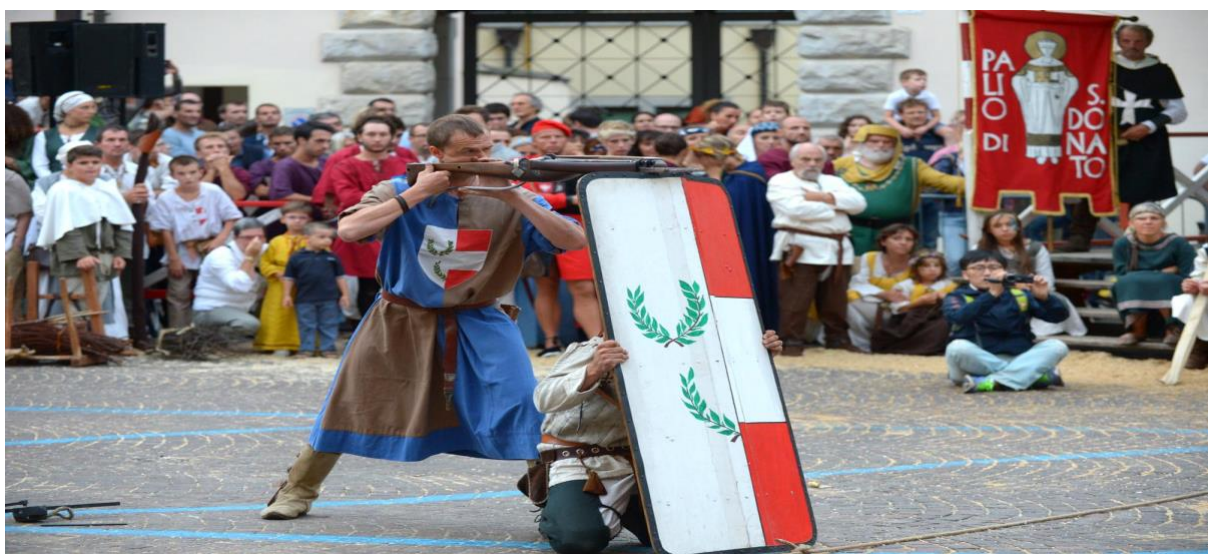
Cividale Del Friuli – Medieval Palio di San Donato

You will see locals dressed in medieval costumes, taking part in contests representing their 'contrade' (medieval town districts), street shows, knights, jugglers, drummers, crossbows, parades and fire. Shop and eat at the local stalls and shops all dressed up to look like medieval times.