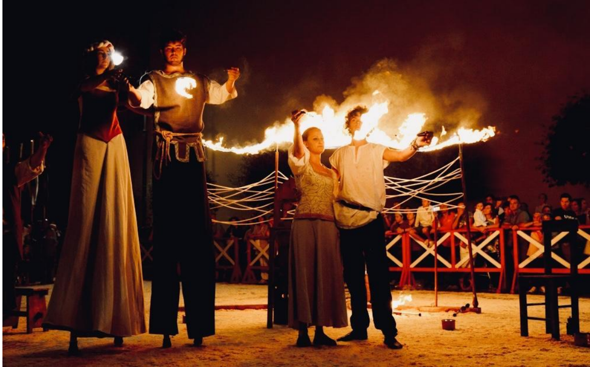
Cividale del Friuli – Medieval Palio di San Donato

Friuli Venezia Giulia: From the Alps to Adriatic Sea (with Medieval Palio of San Donato) 20 th August – 26 th August 2019