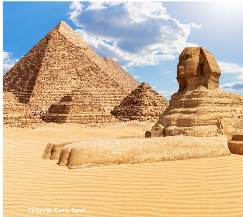
Pyramids, Cairo, Egypt