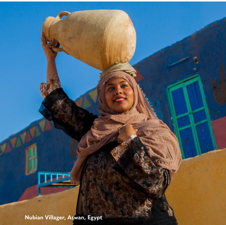
Nubian Villager, Aswan, Egypt