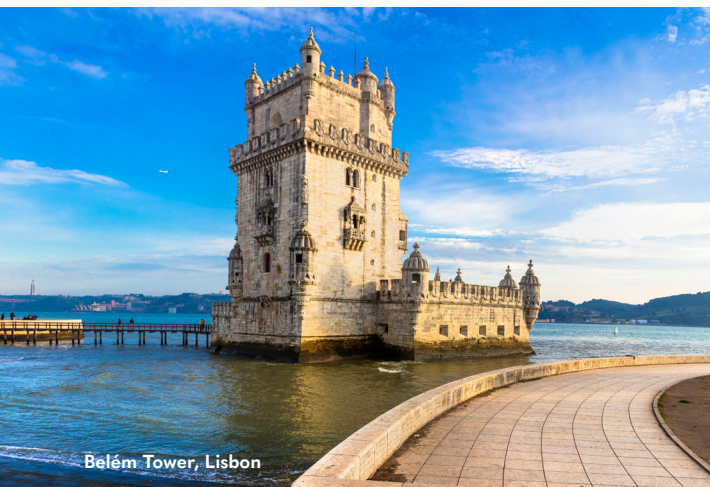
Belém Tower, Lisbon