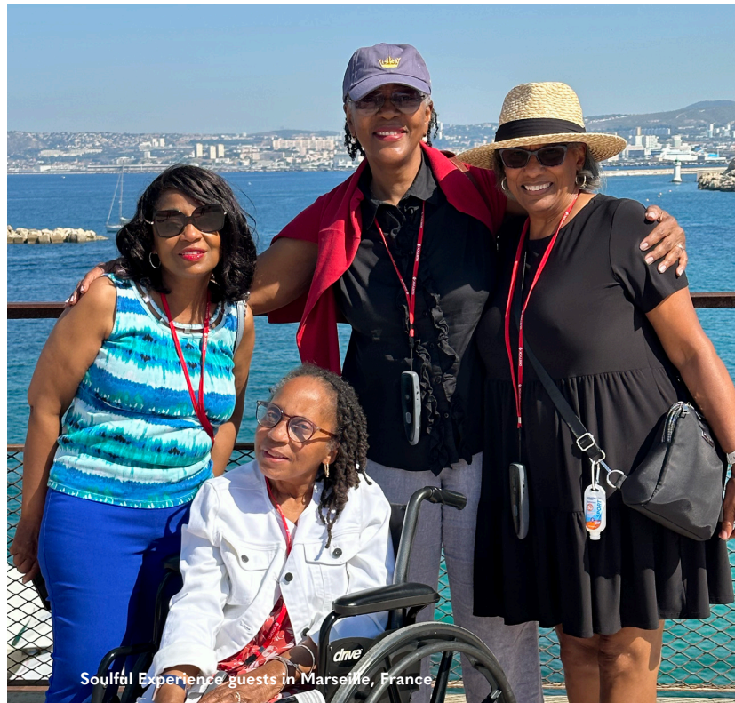
Soulful Experience guests in Marseille, France