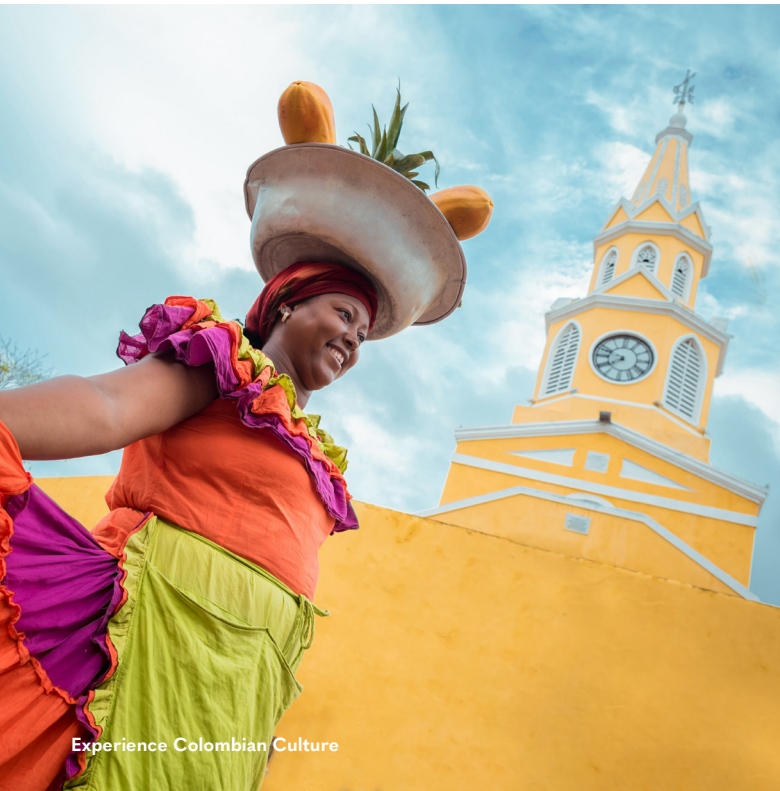
Experience Colombian Culture