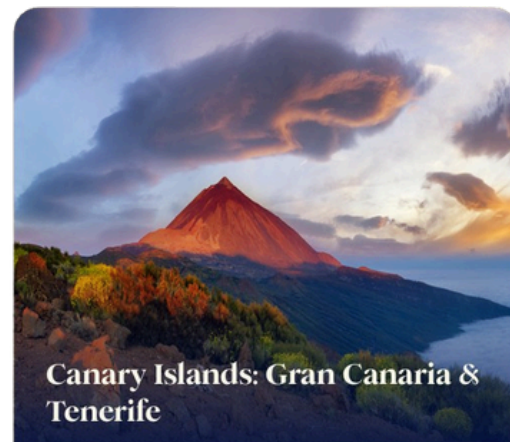
Canary Islands: Gran Canaria & Tenerife