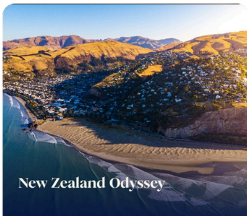
New Zealand Odyssey