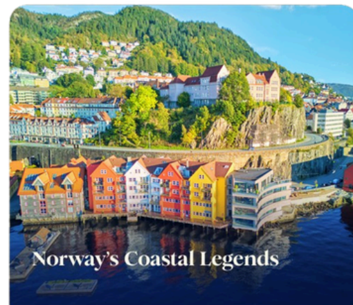
Norway's Coastal Legends