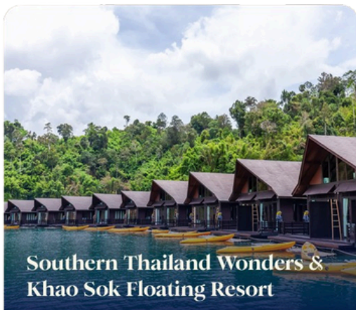
Southern Thailand Wonders & Khao Sok Floating Resort