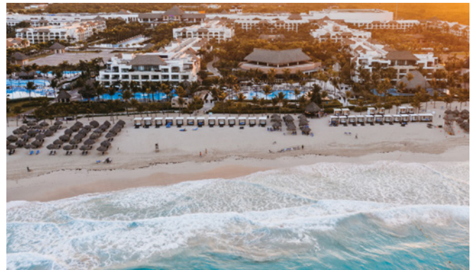
Hard Rock Hotel & Casino Punta Cana