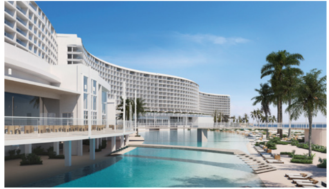
AVA Resort Cancun

Say “I do” at one of our all-inclusive resorts in a top destination of your choosing. Tell us your vision, and we’ll bring it to life. From selecting the correct venue to accommodating you and your wedding party, depend on our professionals to customize and execute your dream day at one of our 7 properties.