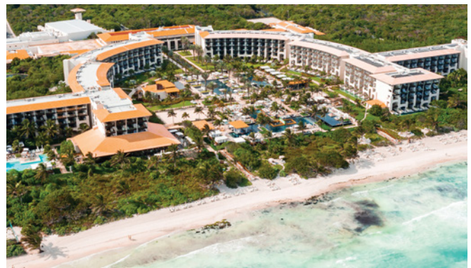
UNICO 20°87 Riviera Maya