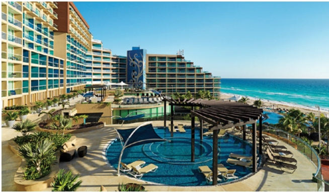
Hard Rock Hotel Cancun