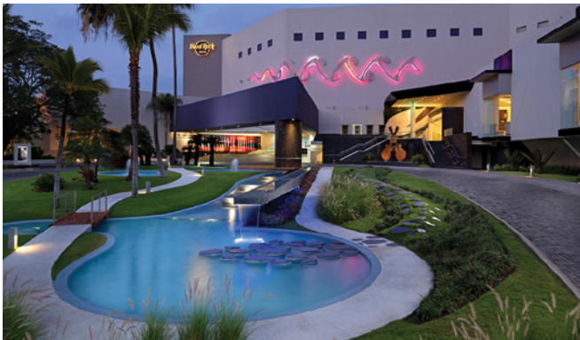
Hard Rock Hotel Puerto Vallarta