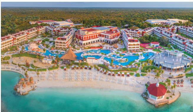
Hard Rock Hotel Riviera Maya