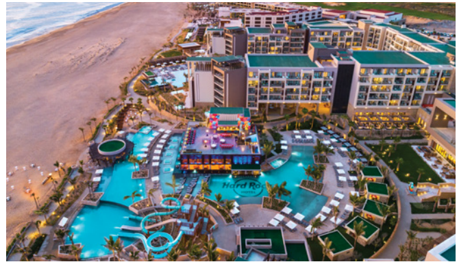
Hard Rock Hotel Los Cabos