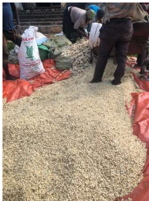
Shelling and bagging the corn

like eggs, milk, sugar, and tea. The farm has helped ensure the orphanage has enough staple foods to support the orphanage year-round via two growing seasons. Corn, beans, and casava are grown on separate portions on the farm to allow crop rotation and regeneration of the land.