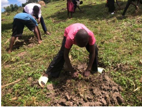
Planting casava stems

Farm: A few years ago, donors generously helped fund the purchase of a 10-acre farm near the