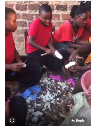
Peeling casava roots

orphanage so they could grow their own staple food products (corn, beans, cassava, etc.) and reduce the cost of feeding the children and staff. Prior to the purchase of the farm, when funds ran out and food ran low, the children and staff were reduced to two small meals a day, often without supplemental foodstuff