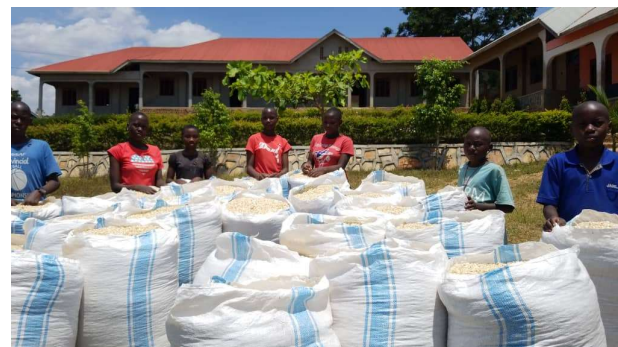
Processed corn seeds from the farm

There is one glitch with the farm at this stage, as you can read in the “Projects: Irrigation” section later in this newsletter.