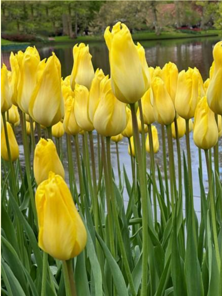
Tulips, Keukenhof Gardens, Netherlands