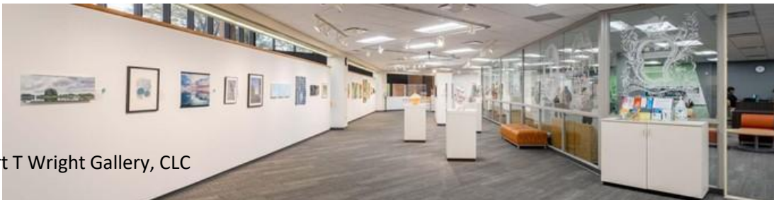
Robert T Wright Gallery, CLC