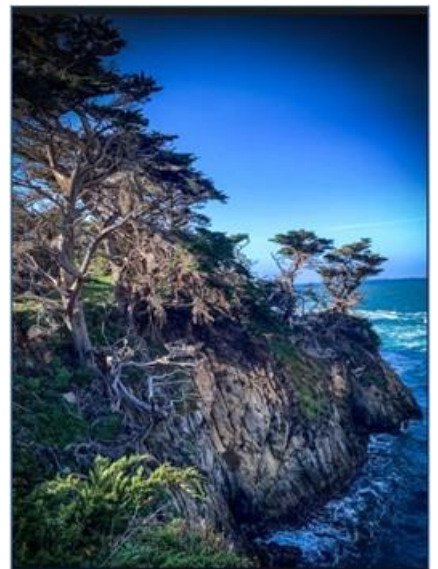
"Point Lobos 2025"