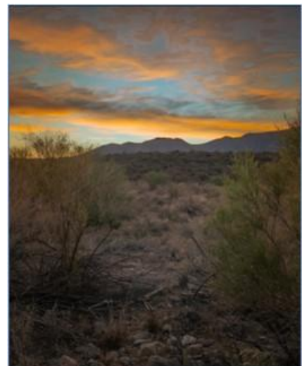
"Desert Morning "

It took but a few moments of mindful presence to see the beauty and contradiction of this place; the parched golden grasses scratch out a desert existence next to rich green shrubs. So profuse, they almost cover a nearby hillside already dotted with cinder black desert ironwood.