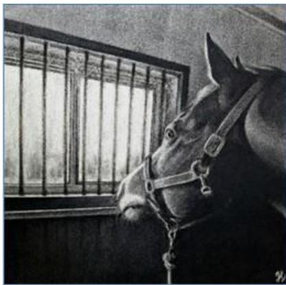
“1 Yearn for Freedom” Charcoal