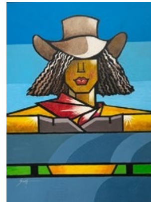
"Buckaroo in Bronze" 18x14; scratchboard Les Scott