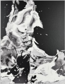
Spring Show Entry 32 "Decisions, Decisions," a photograph by Mary Neely