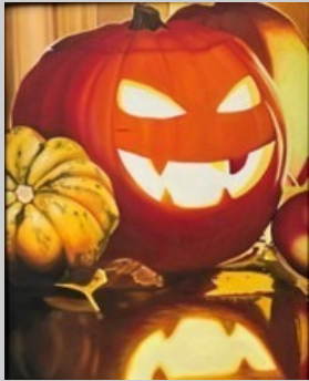
Odessa Haw Tay “Warm Halloween” Oil