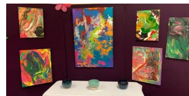
Mona Phiffer abstracts