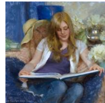
Tea & Inspiration