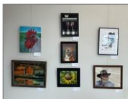
Artworks on display