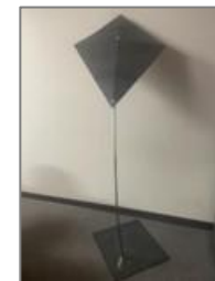
Kites before painting (left) and after (right; "Gnome Stack")