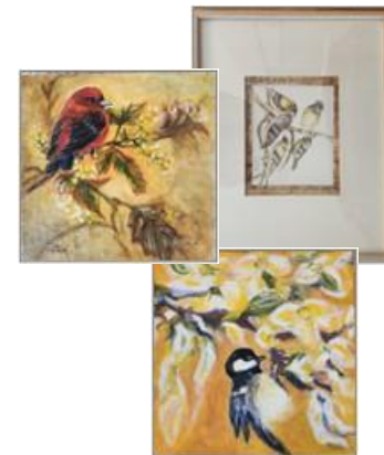
3 pieces by Sandra Saxton