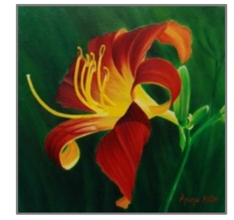
"Red Lily"; Oil; 12"x12" Aruna N Sarode

Questions: Contact Aruna at arunans@hotmail.com or website.