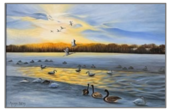
"Golden Hour"; Oil; 24"x36"