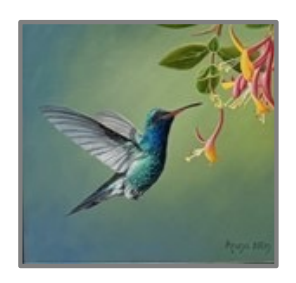
"Broad-billed hummingbird", Oil 12"x12"