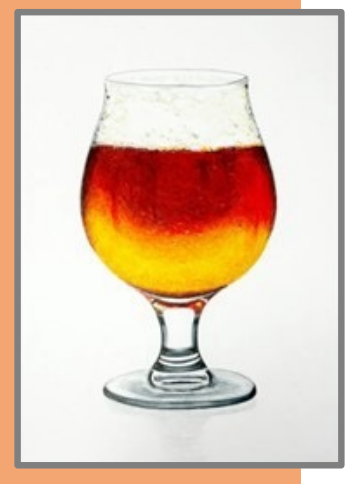
"Cheers" Colored Pencil