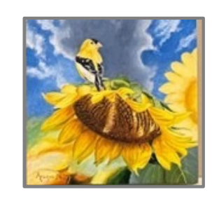
"Sunflower Gold", Acrylic 8"x8"