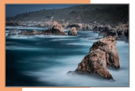
"Time Stands Still"

Garrapata State Park sits like a jewel along the sparkling northern California coast, with 2 miles of beachfront, coastal hiking trails and, most importantly, stunning views of the Pacific Ocean.