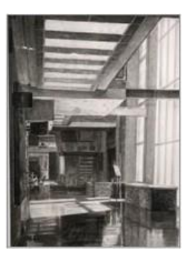
Phoebe Boyd Scholarship Jiayi Yang "Hallway Sketch" Charcoal