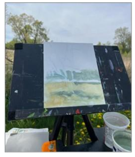
Simple Easel & Paint Set-up