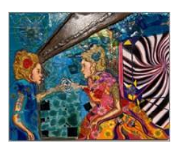
$50 award Sadie Saller "Through the Looking Glass" Mixed media