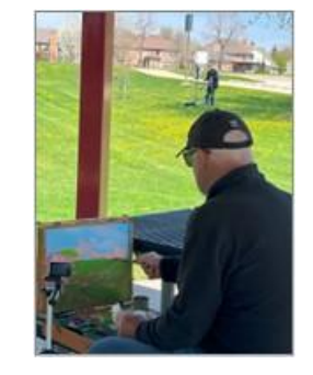
Painters enjoy spring colors and weather

A simple set up can include a travel set of paints or limited palette, an easel or chair, brushes, solvent/water, and items to keep your brushes clean.