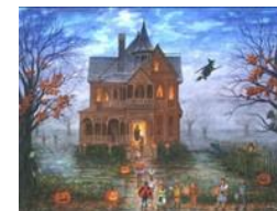
"Witches and Moon" Watercolor