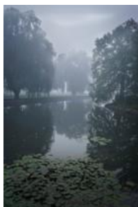
"Morning at Jones Island"

Questions? Contact Ernest at ernestschweit@sbcglobal.net