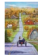
"Fall Buggy Ride" Transparent watercolor

Questions? Contact Jim at jimbrooksher@gmail.com