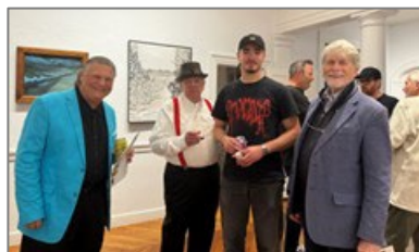
Some members in attendance

On "Gallery Night," about 20 artists answered questions about their art, and also shared art pieces from their past. It was interesting and fun to talk about past experiences with everyone's art endeavors, and a great way to connect the art with the artist.