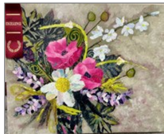
Clarese Ornstein Mixed Media