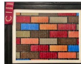
Les Scott Scratchboard