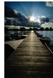
“The Way” 24” x 16”

Questions? Contact Ernest at 847-609-8070 or ernestschweit@sbcglobal.net