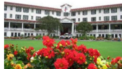
Photo of Shawnee Inn