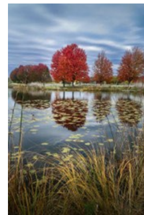
"Autumn Glow" Photography 24x16 inches printed on metal

Questions? Contact Ernest at 847-609-8070 or ernestjschweit@sbcglobal.net