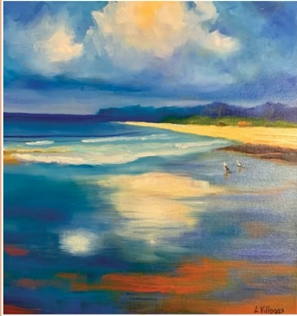
“Beach Reflections” Oil over acrylic base coat 16” x 16” (40 x 40 cm)

The critique was done as part of an online video course I do with Richard Robinson. Even though there were negative as well as positive comments, it was nice to be shown in the magazine!