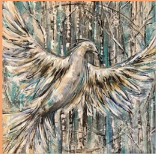
For the Birds logo

Questions: Contact Clarese at 1-847-525-7823 socoro@comcast.net