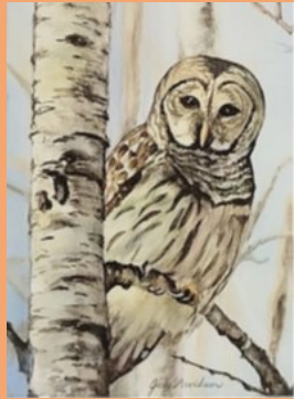
Barred Owl