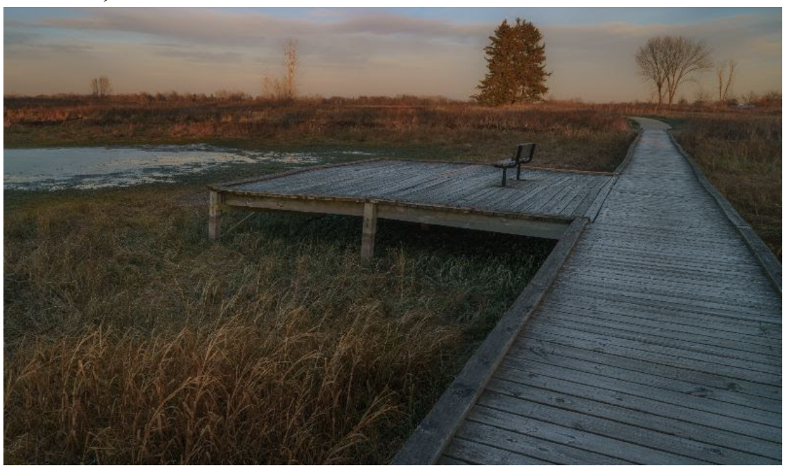
The beauty, the dark side of vanishing wetlands

"Awakening" is one of the images I'm considering showing at the two shows on my schedule this winter: the Member Exhibition at the Robert T. Wright Community Gallery (<a href="www.clcillinois.edu/campus-life/arts/wright-gallery">www.clcillinois.edu/campus-life/arts/wright-gallery</a>) on the campus of College of Lake County in Grayslake, starting Jan. 21st, and the Member Exhibition at the Adler Arts Center (<a href="www.adlercenter.org">www.adlercenter.org</a>) in Libertyville, beginning Feb. 11th. Both shows typically draw some of the best artists in the region, so if you are in the market for unique, one-of-a-kind work for your private collection or your business, don't miss these shows.