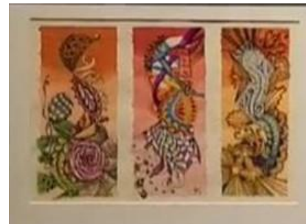
Fran Isaac; "All Washed Up"