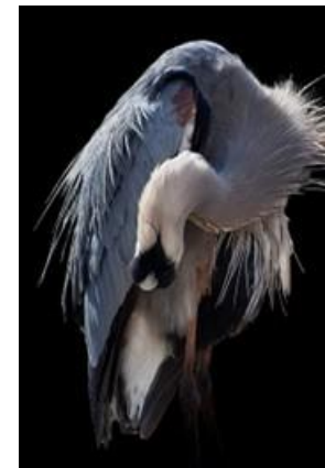
Jeff Harold photograph "Avian Portraits - Great Blue Heron Textures"