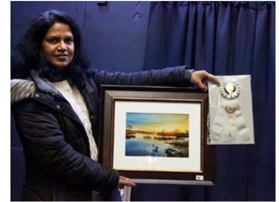
Third Place Aruna Sarode Water color "Sunset Reflections"