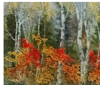
Honorable Mention Pat King Water color "Gifts From the Land"