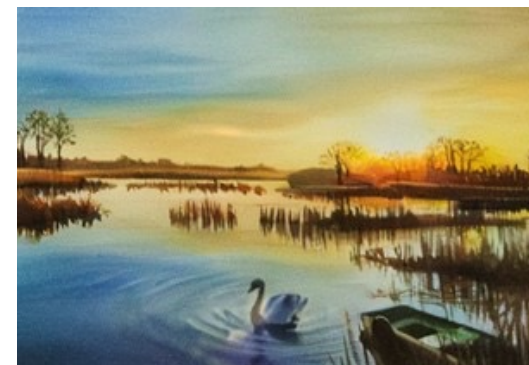
Third Place Aruna Sarode Water color "Sunset Reflections"