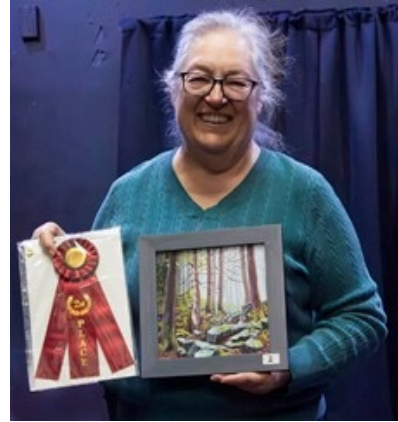
Second Place Fran Isaac Acrylic "Into the Woods"