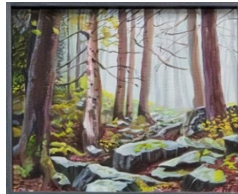
Second Place Fran Isaac Acrylic "Into the Woods"