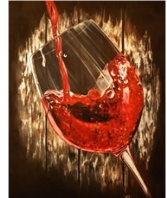
The Glass Wood background

I finished the image I was working on (shown on the easel to the left and image on right). Let me know if you may be interested in it.