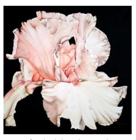
I finished this Lily over the holiday's color pencil, 18" x 18"