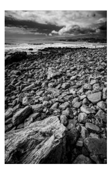
"Day at the Shore" Beach near San Pedro, CA