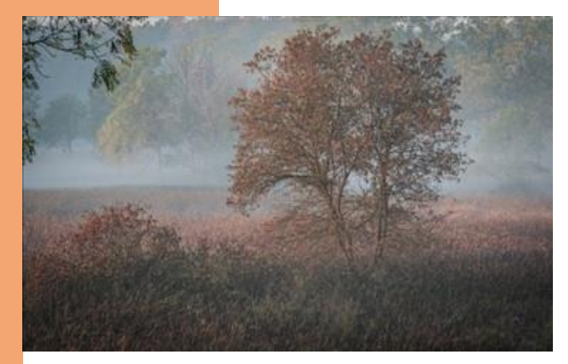
"Immersion" McDonald Woods near Lake Villa, IL

From the images I made in 2023, in the deserts of AZ, the shorelines of Big Sur, CA, and the forests of Lake County, IL, I selected those that, months after creating them, still evoke a strong feeling of what I had experienced the day I made them, and that best reflect how I see the natural world: a place of drama, color, texture, shape and contradiction.