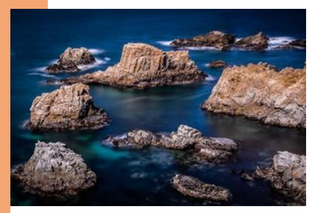
"Scattered" Garappata State Park in Big Sur, CA