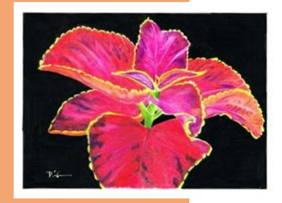
A coleus from the Botanical Gardens color pencil 5" x 7"

It is a new year, and a lot of news already. I had a lot of fun doing my New Years' challenge. I give this out to my students as well. It is where you start and complete an entire drawing of your choice over the New Year's holiday.