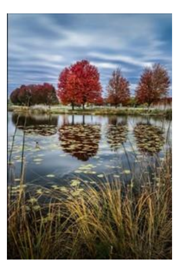
"Autumn Glow" Independence Grove in Libertyville, IL