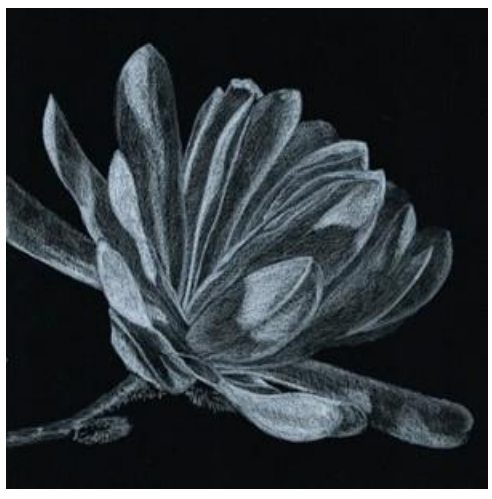
I've done several renderings with just black, white and silver color pencils. This Magnolia 8" x 8", is from the tree in my backyard.