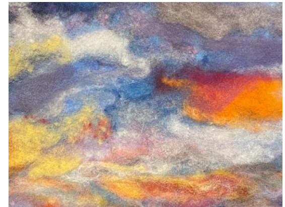
Painting in Fiber