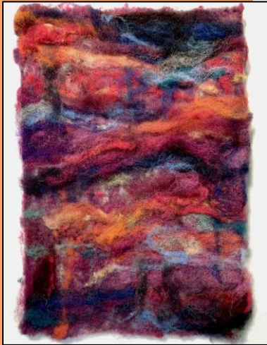
Painting in Fiber

I'll be a guest artist Nov/Dec at Blue Moon Gallery , 18 Nov 2023 – 7 Jan 2024! I will be debuting my latest collection of new works called “paintings in fiber,” and will be the first fiber artists to show at Blue Moon Gallery.