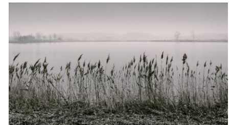
"Simple Lines:" available at upcoming Tonality show