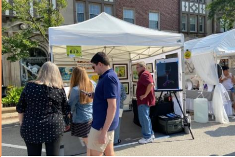
Highland Park Show

I'm astounded at how fast the summer has slipped by, the shows are making the time go by fast.