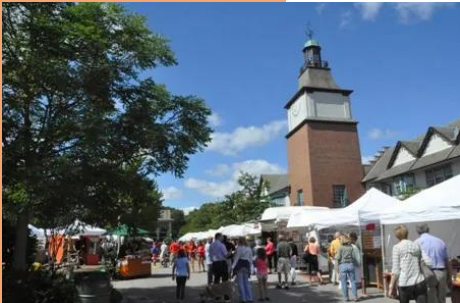
Art Fair on the Square

Here is an Instagram link showing me while I was drawing in Evanston.