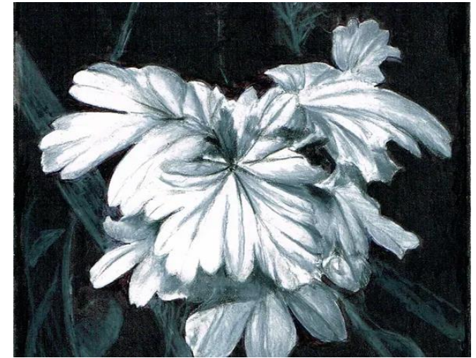
B/W Ground Leaves