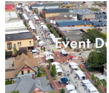
Art on the Fox

9 and 10 Sep, I was in Algonquin for "Art on the Fox."