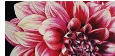
“Pink Dahlia” Colored pencil (partial image)