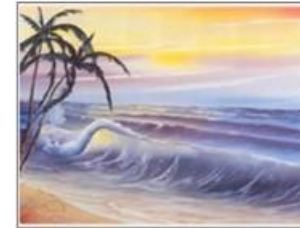
Example of Bob Ross' style. "Tropical Seascape" from The Joy of Painting , Season 12, Episode 9