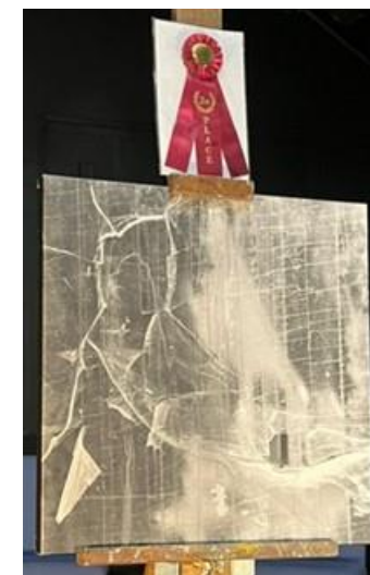
2 nd Place; Mary Neely "The Meeting" 20" x 30" photograph