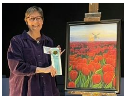
Honorable Mention Diane Gricar "Tulips" 18" x 24" oils