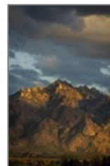
"Mighty" 24x16 canvas print Catalina Mountains in AZ

Questions? Contact Ernest at 847-609-8070 or ernestjschweit@sbcglobal.net