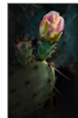
"Promise" 11x17 canvas print AZ