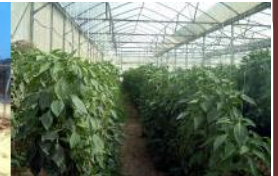
Inside the Hot Houses