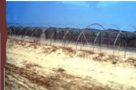
Hot Houses in Israel