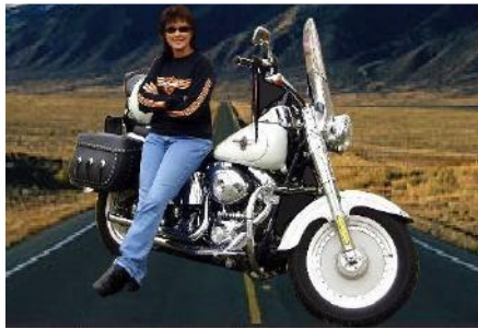
From The Nations